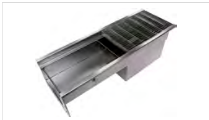
GRILLED CHANNEL WITH TRAP