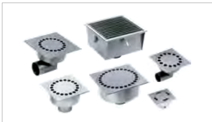
INDIVIDUAL TRAPS AVAILABLE IN SEVERAL TYPES AND DIMENSIONS