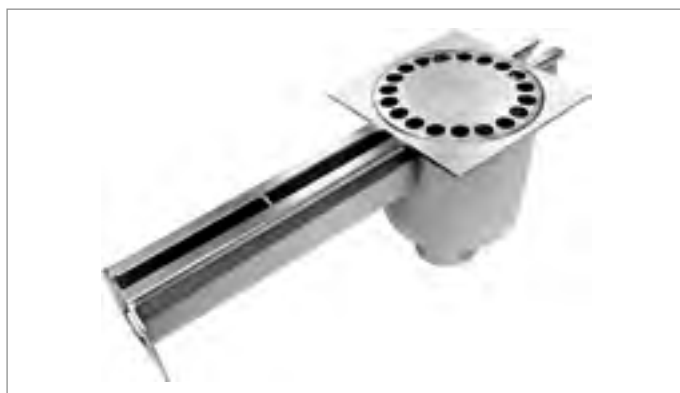
FISSURE TYPE CHANNEL WITH VERTICAL DRAIN TRAP